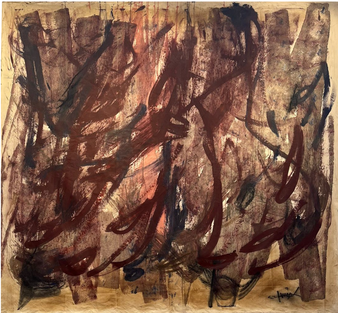
Title: Untitled (2023) Medium: Mixed media on canvas Size: 96 x 108.2 inches