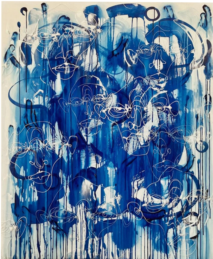
Title: Within the Turbulence, there is Expression (2022) Medium: Acrylic and mixed media on canvas Size: 39.3 x 47.2 inches