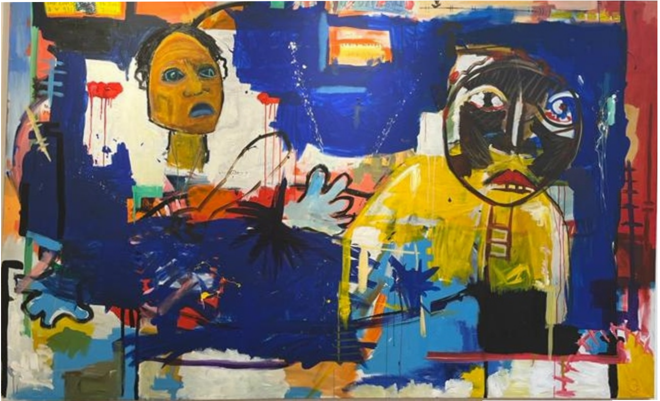
Title: Almost blue (2023) Medium: Acrylic on canvas Size: 60 x 96 inches