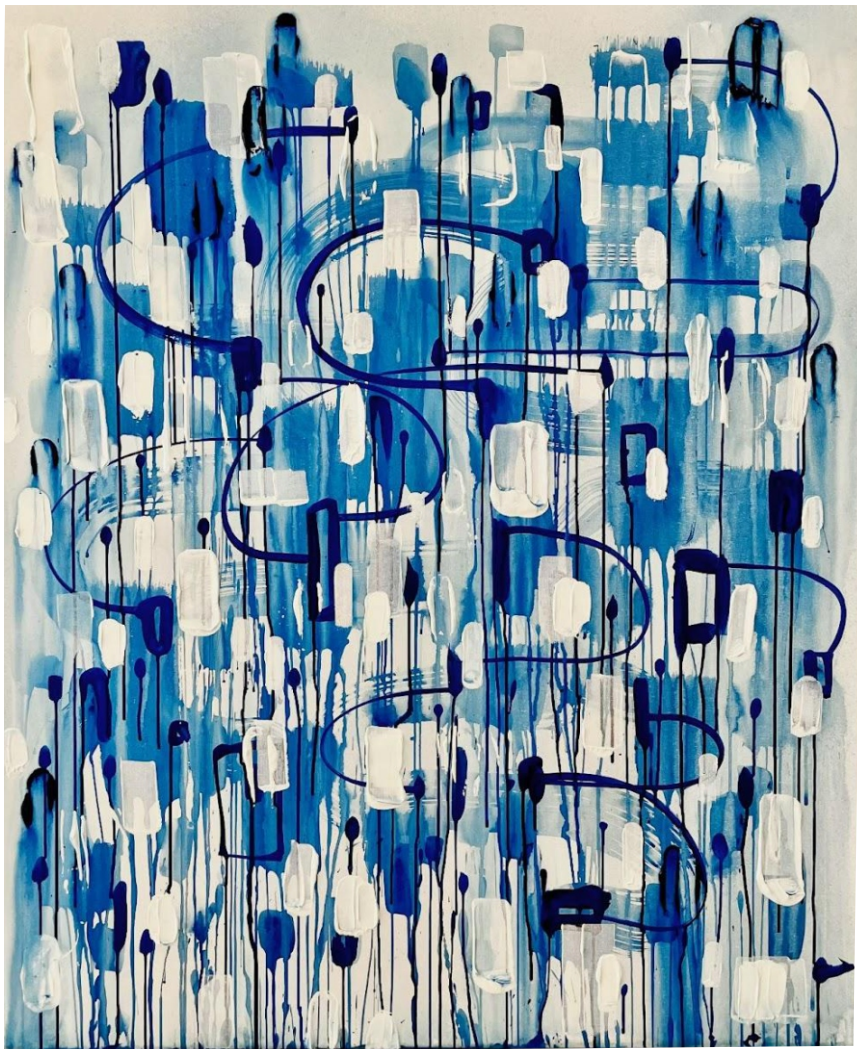
Title: Do you see, what i see (2022) Medium: Acrylic and mixed media on canvas Size: 39.3 x 47.2 inches