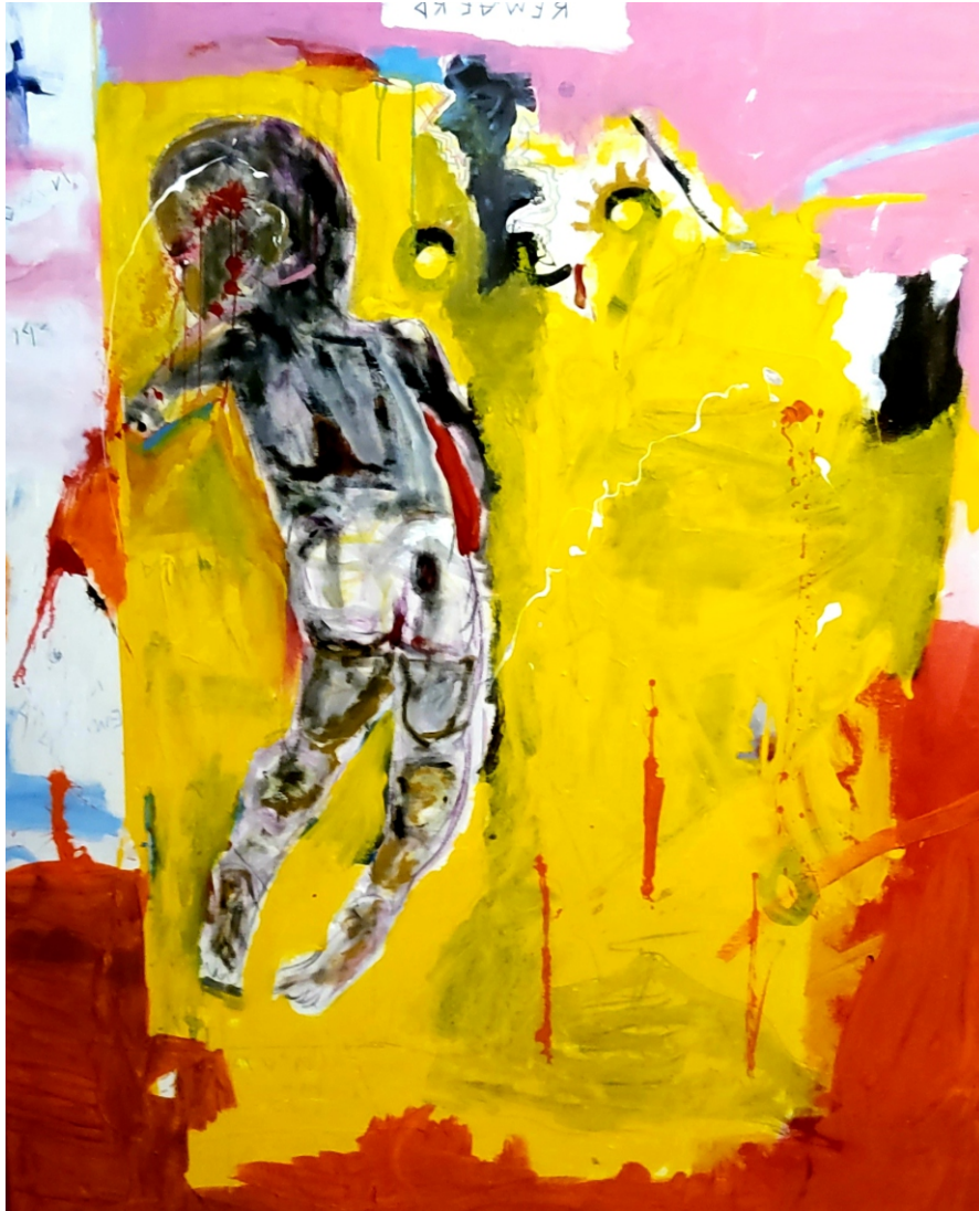
Title: Just a dream (2023) Medium: Acrylic on canvas Size: 60 x 48 inches