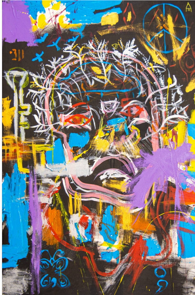
Title: Cerebral (2020) Medium: Acrylic on canvas Size: 36 x 48 inches