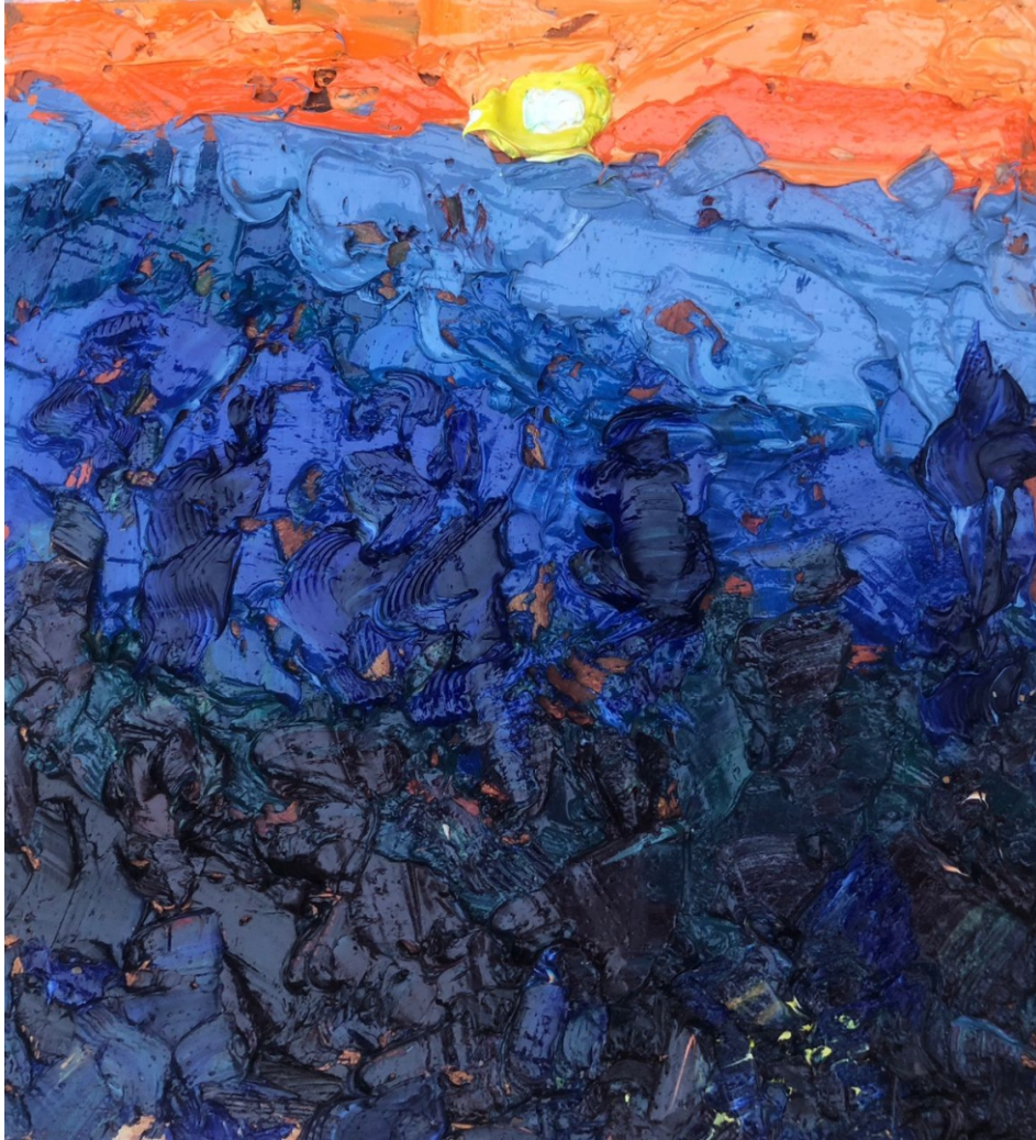
Title: Energy Movement (2023) Medium: Acrylic on canvas Size: 11 x 12 inches