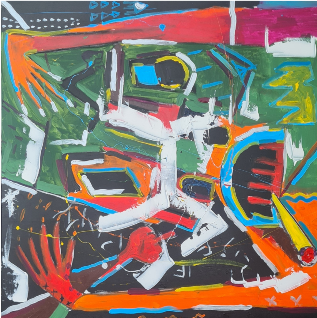
Title: Kójú máribi (Vigilance/Precaution) Medium: Acrylic on canvas Size: 36 x 36 inches