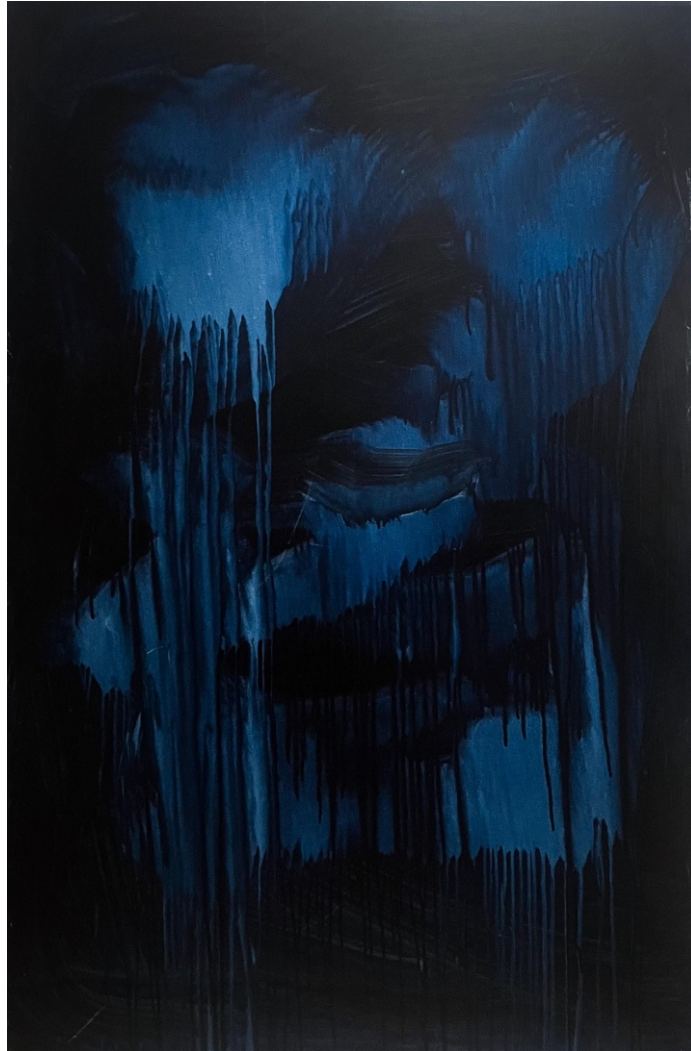
Title: Internal Blue (2022) Medium: Acrylic and mixed media on canvas Size: 39.3 x 59 inches