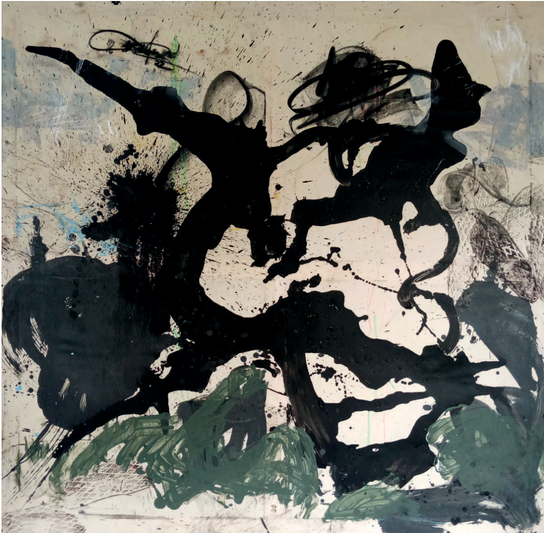
Title: The Kissers (2022) Medium: Mixed media on canvas Size: 60 x 60 inches