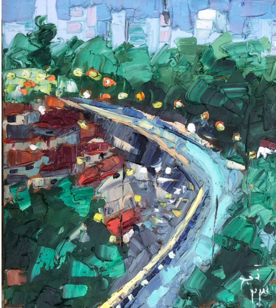
Title: Somewhere in VI (2023) Medium: Acrylic on canvas Size: 11 x 12 inches