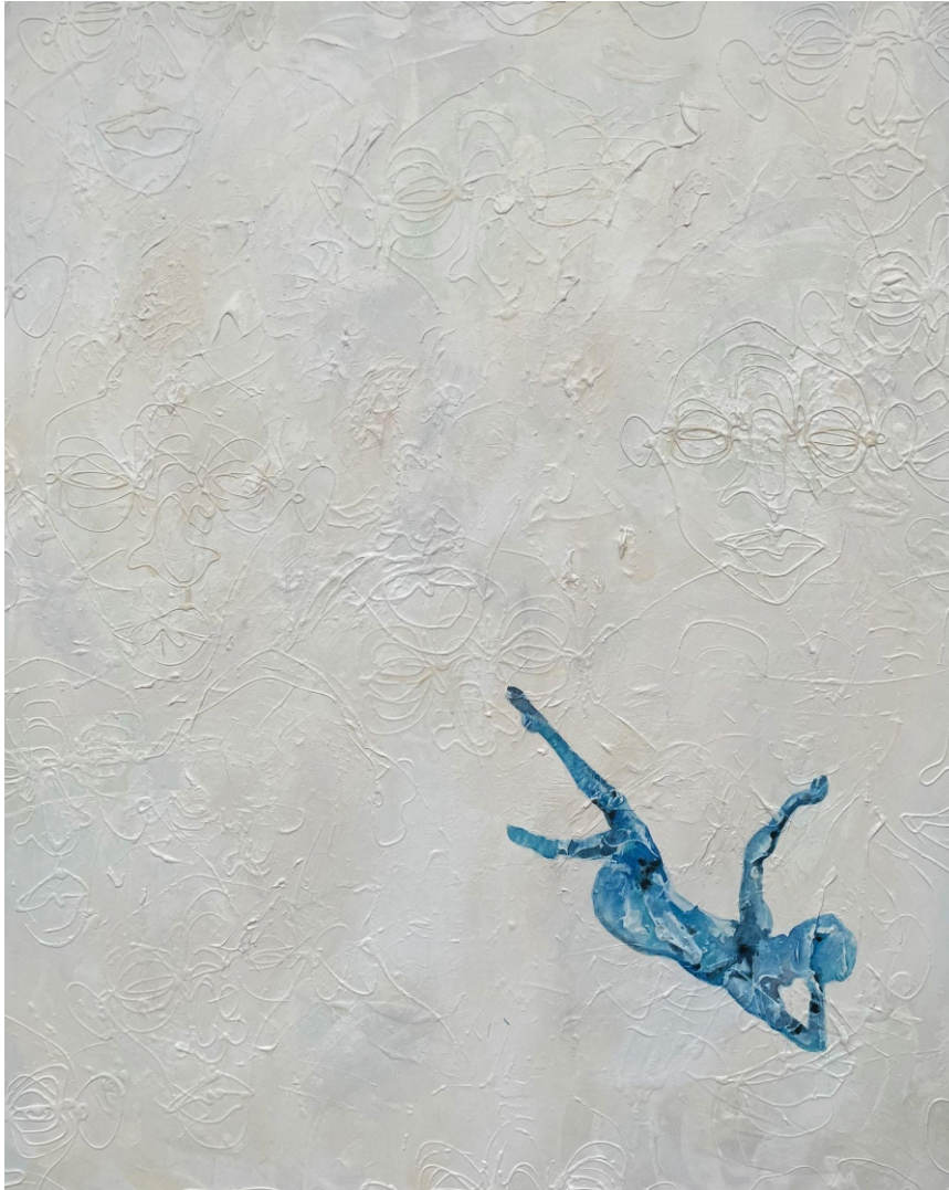
Title: The Search (2022) Medium: Acrylic and mixed media on canvas Size: 60 x 48 inches