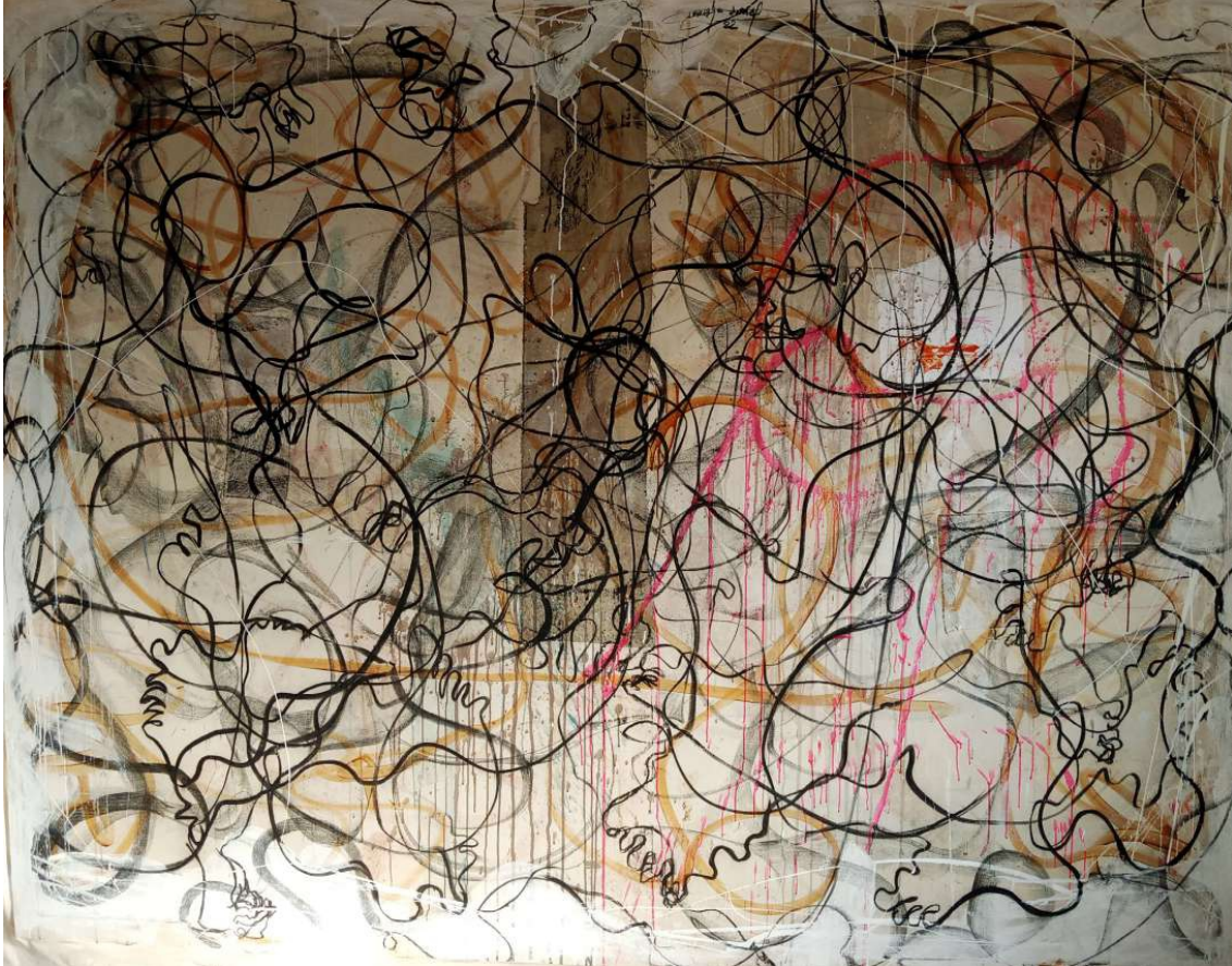
Title: Her episodes (Vee's episodes) (2022) Medium: Mixed media on canvas Size: 96 x 108.2 inches