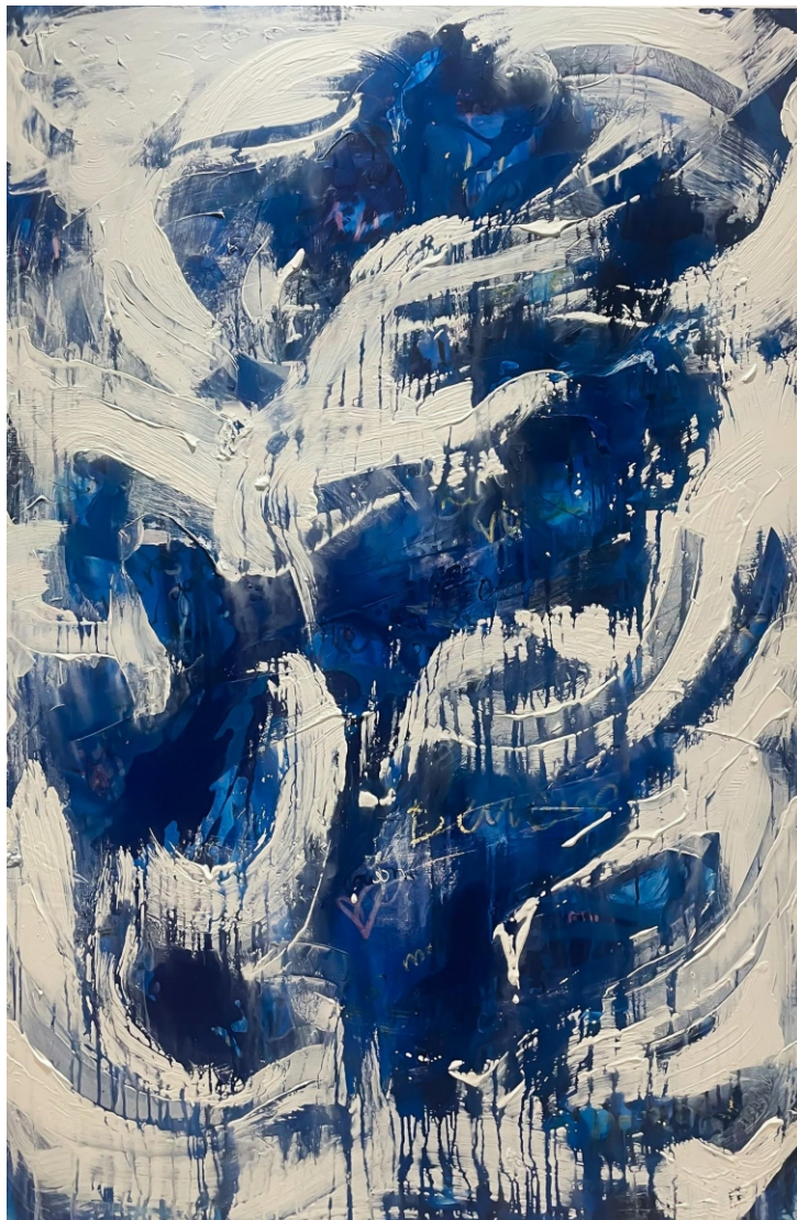
Title: Rhythm and Blues (2022) Medium: Acrylic on canvas Size: 39.3 x 59 inches