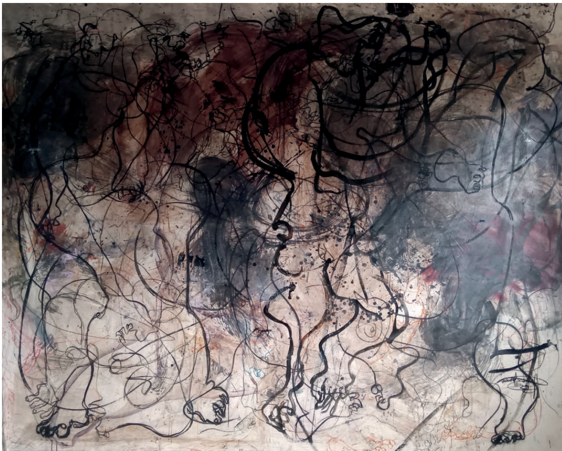
Title: Untitled (2022) Medium: Mixed media on canvas Size: 96.4 x 105.5 inches