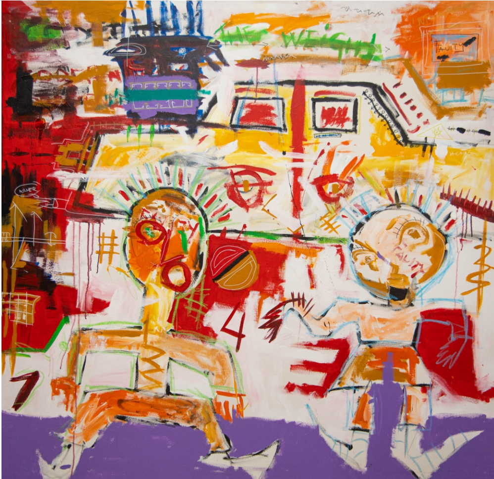
Title: Co-dependency (2022) Medium: Acrylic on canvas Size: 60 x 60 inches