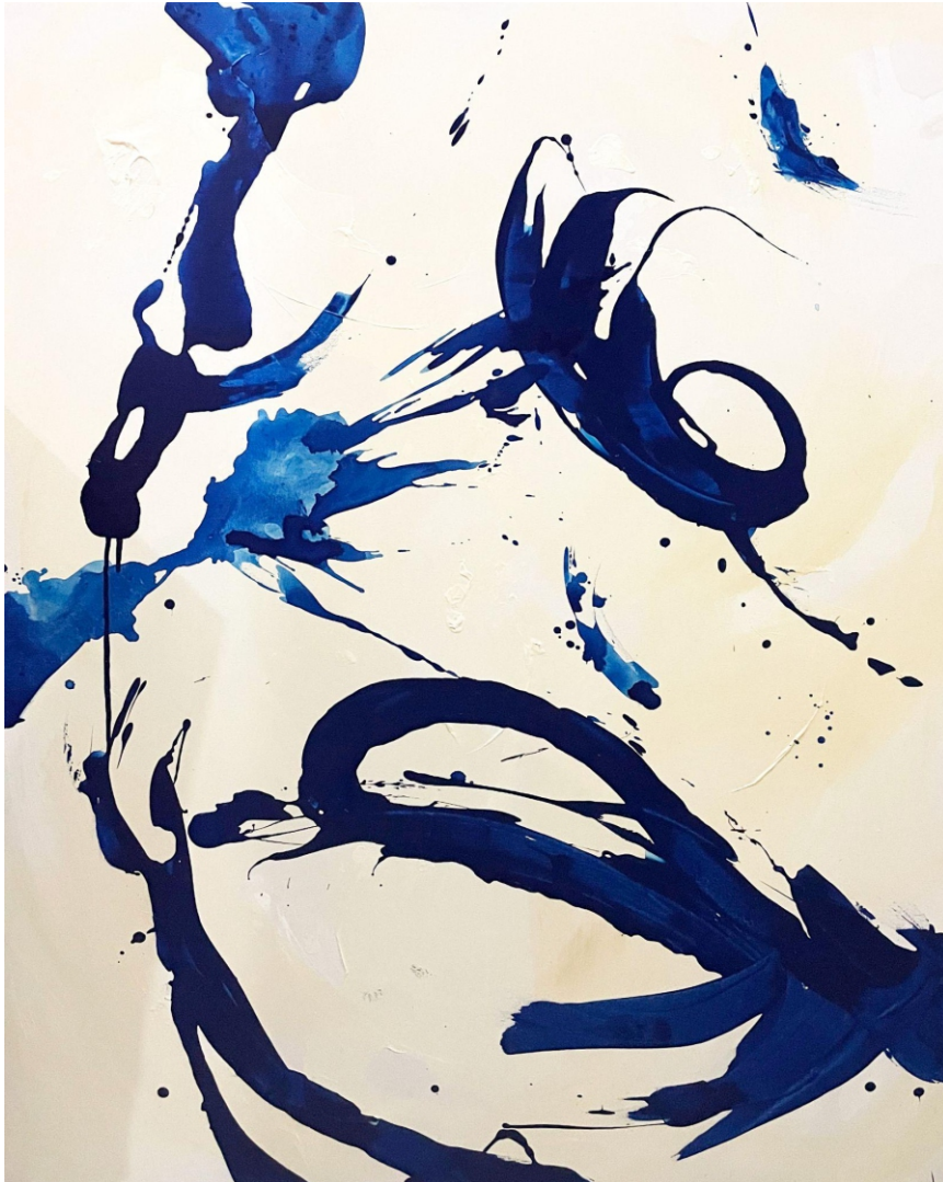
Title: Free (2022) Medium: Acrylic on canvas Size: 48 x 36 inches