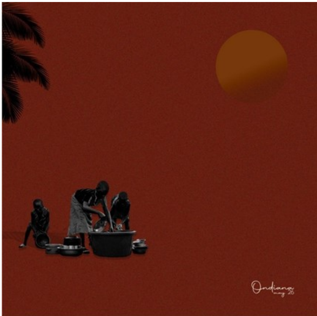
Title: Childhood (2020) 16 cm x 16 cm