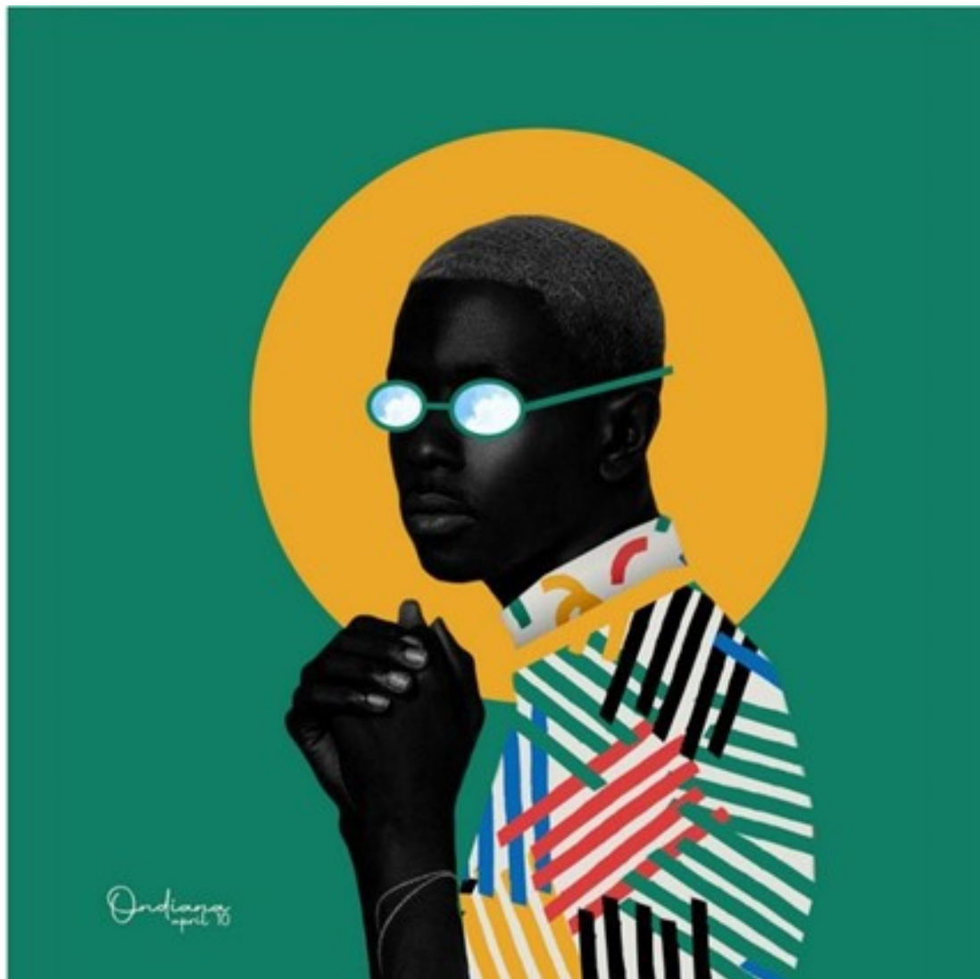
Title: Suspend (2020) 16 cm x 16 cm