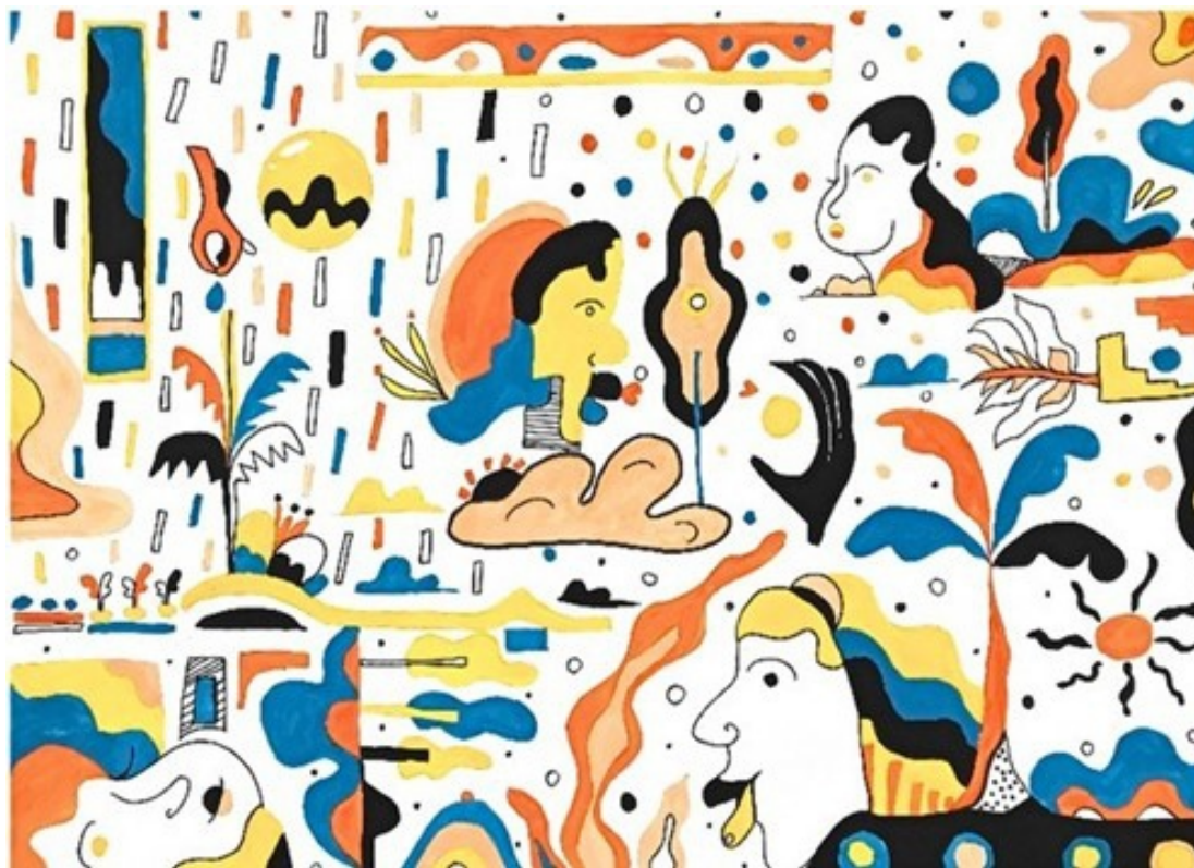
Title: Rain Show (2021) Gouache & ink on paper 11.7 cm x 16.5 cm