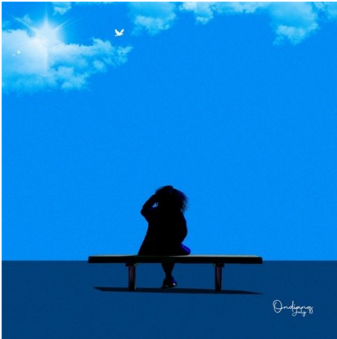
Title: Reticence (2021) 16 cm x 16 cm