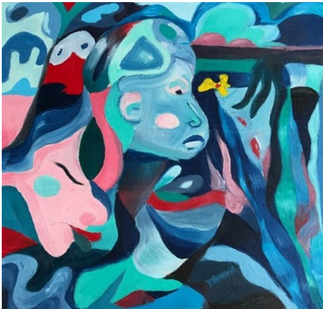
Title: So, You Like Flowers Too? (2022) Oil on canvas 15 cm x 15 cm