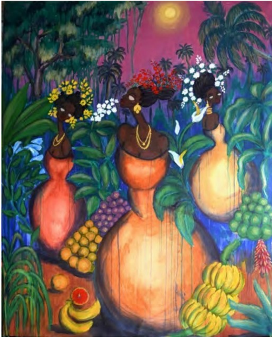
Title: The Three Graces - We Can Mend This Broken World (2019) Acrylic and Oil Pastel on Canvas, 110 cm x 90 cm