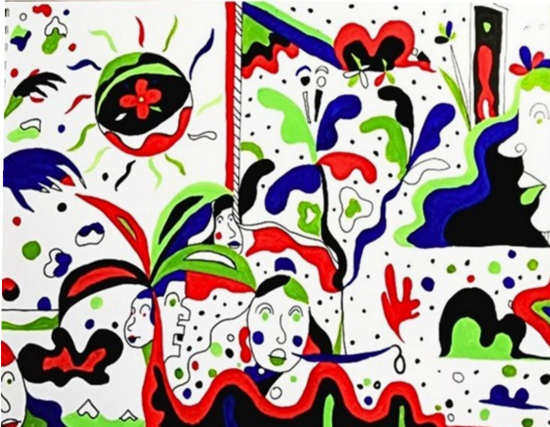
Title: Storm & Sun , (2021) Gouache & ink on paper 11.7 cm x 16.5 cm