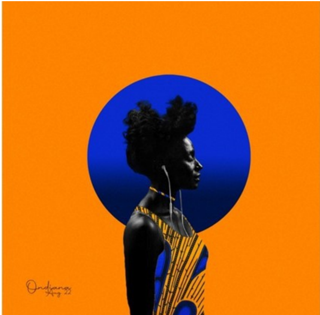
Title: All the Bright Places (2020) 16 cm x 16 cm