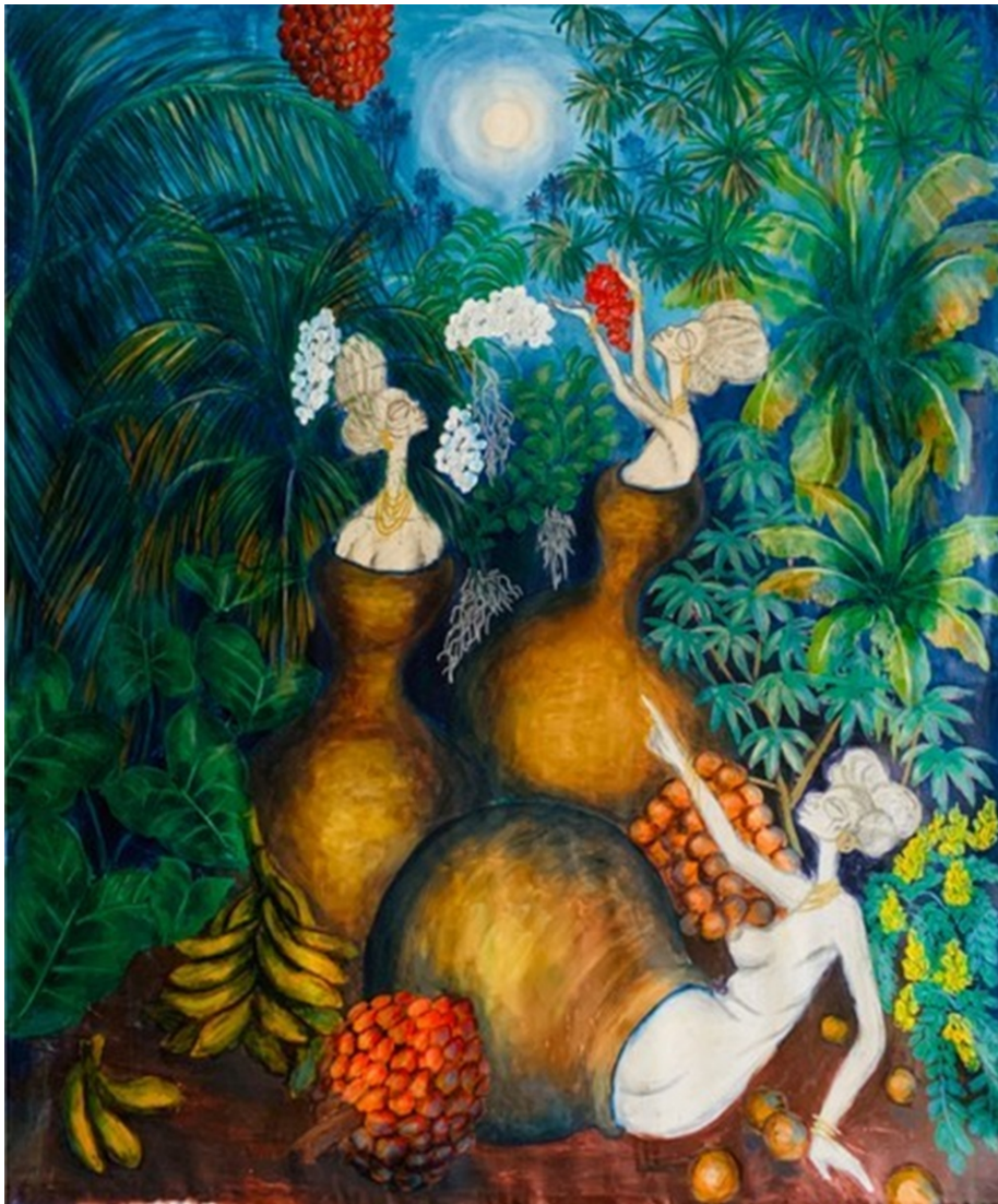
Title: Aye Loja | Aye Raye- The World is a Marketplace but Life is Eternal (2023) Acrylic and Oil Pastel on Canvas, 140 cm x 122 cm