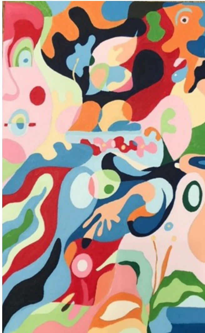
Title: The Connection Between Two Lovers , (2021) Oil on canvas 24 cm x 32 cm