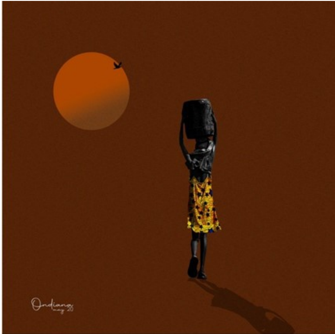
Title: Homecoming (2020) 16 cm x 16 cm