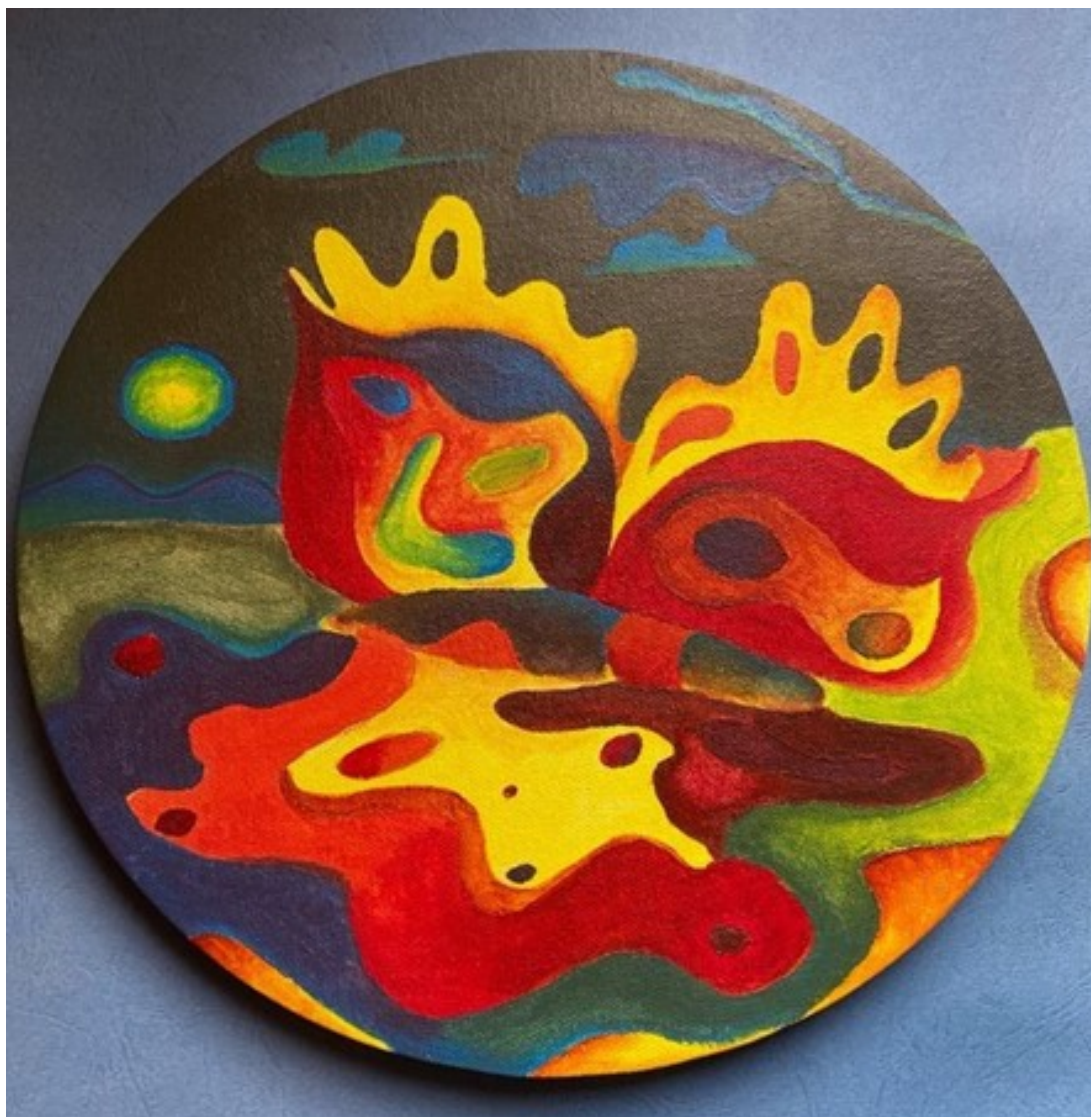
Title: Dead Butterfly (2023) Acrylic on canvas 11.6 cm x 11.6 cm