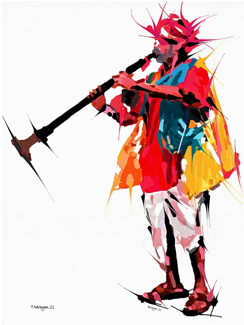
Title: Kakaki (2021) Limited Ed. Print on Fine Art Paper 70 cm x 56 cm