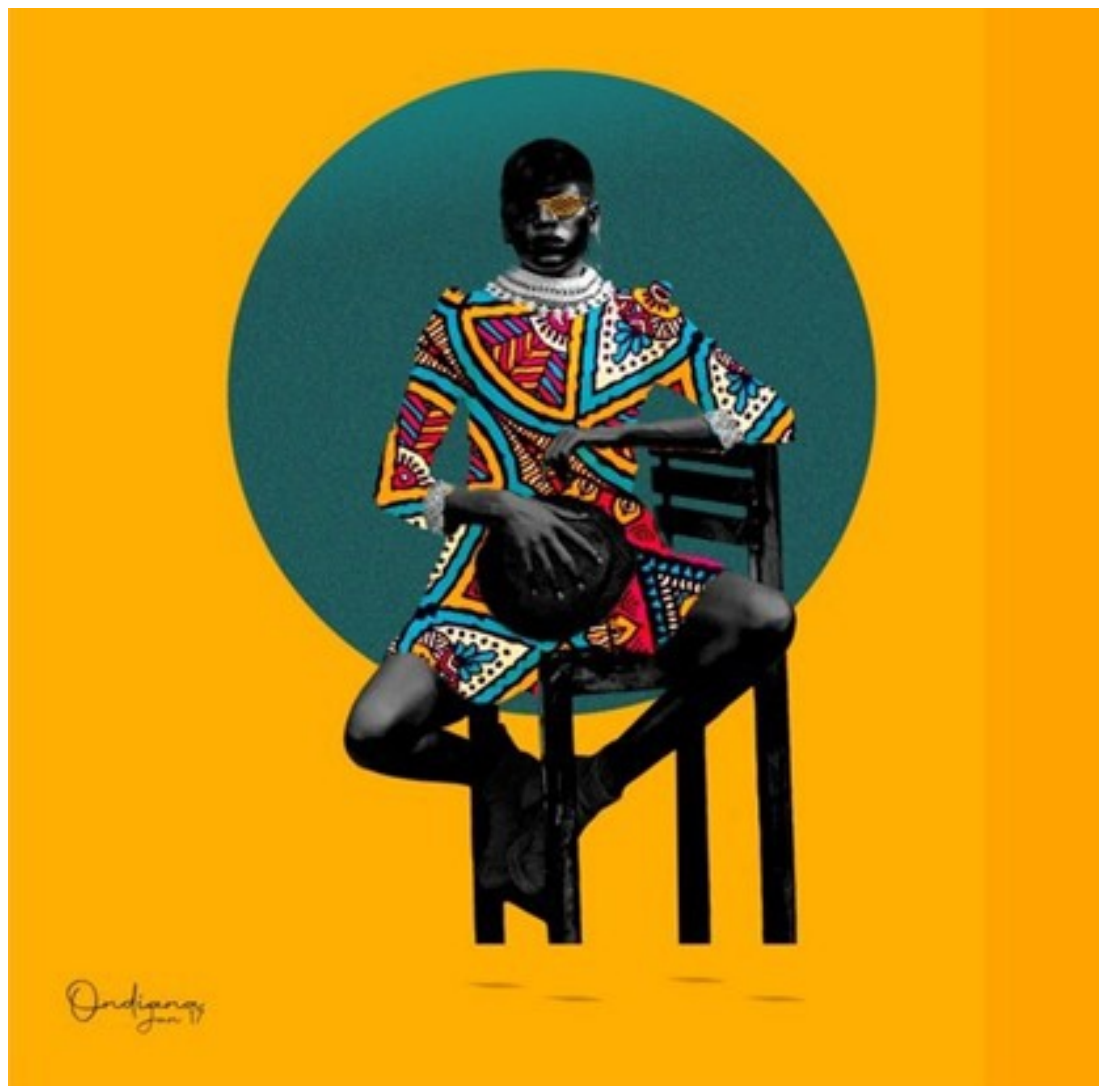
Title: Kingie (2021) 16 cm x 16 cm