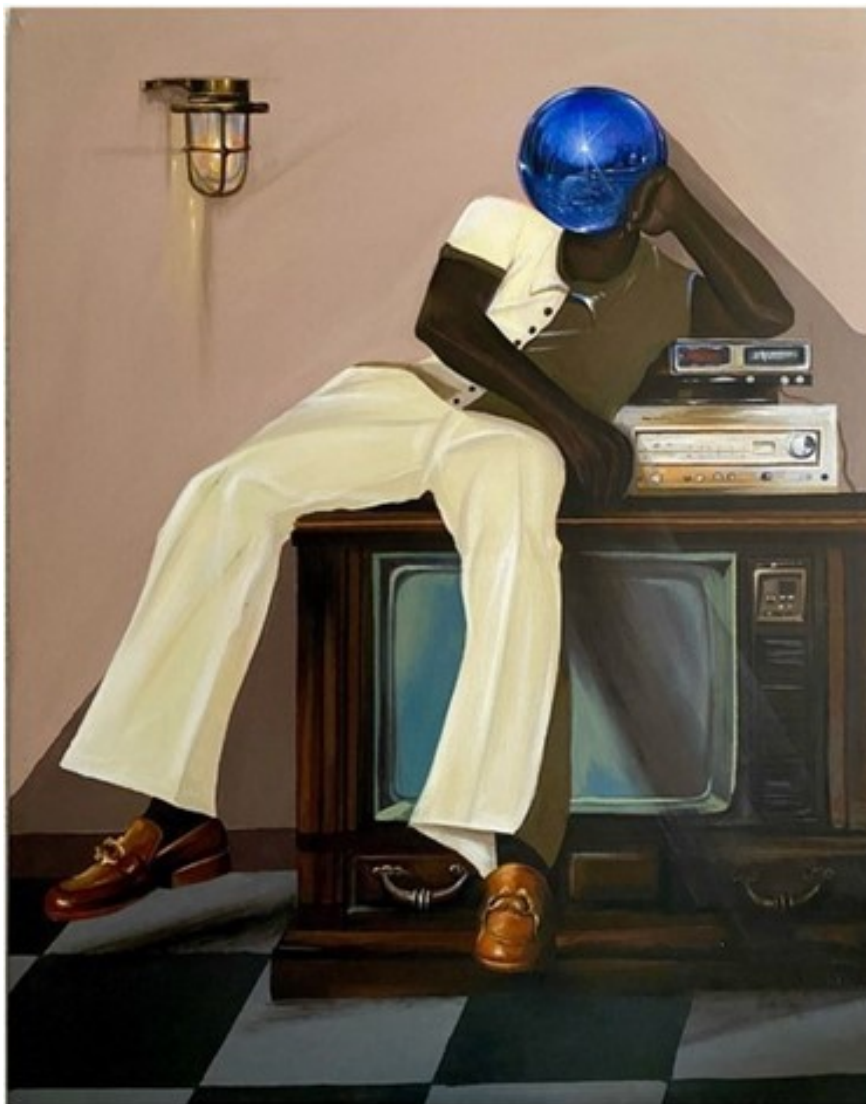
Title: Light At The End of the Tunnel (2023) Acrylic on canvas 122 cm x 94 cm