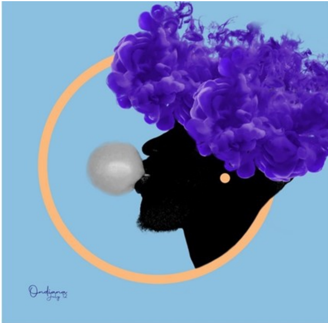
Title: Homecoming (2020) 16 cm x 16 cm