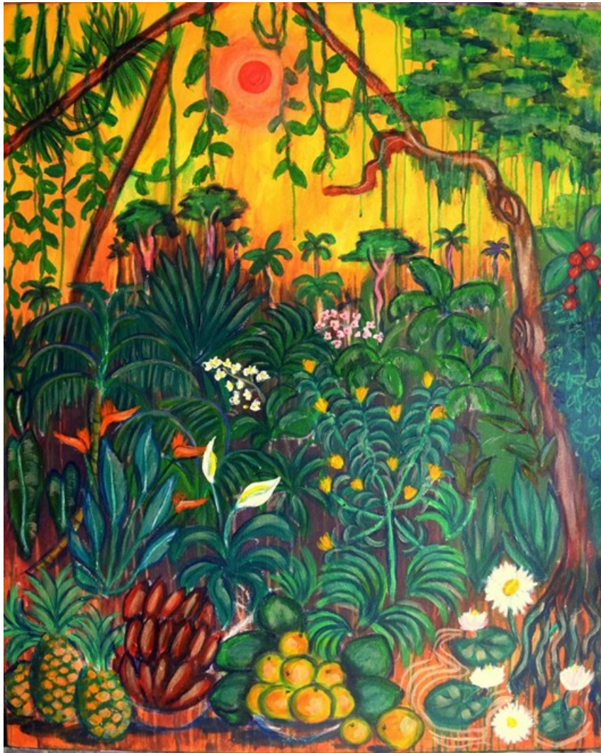
Title: What Money Can't Buy (2020) Acrylic and Oil Pastel on Canvas, 110 cm x 90 cm