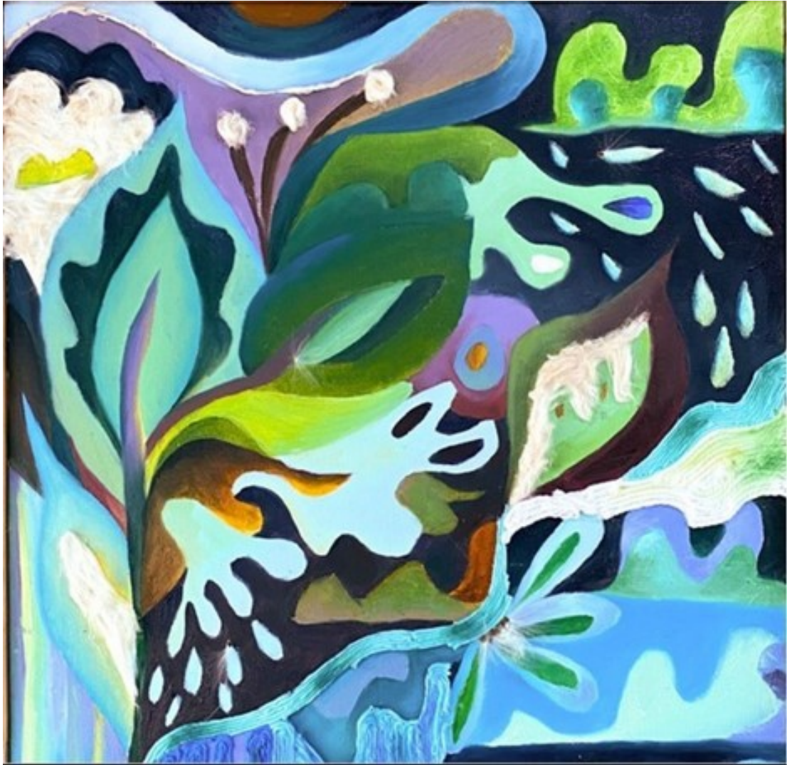
Title: Stage One (2023) Mixed Media on canvas 24 cm x 24 cm