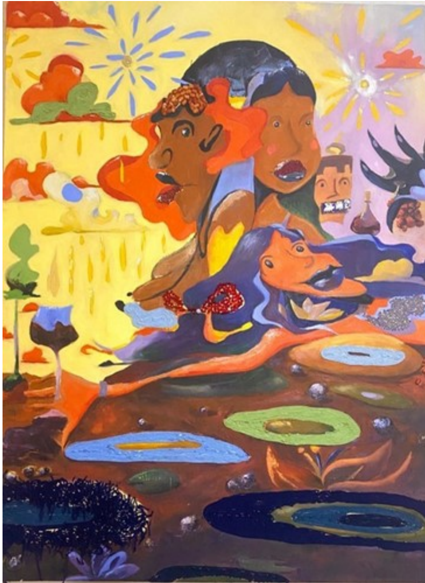
Title: Drunken Celebration (2023)