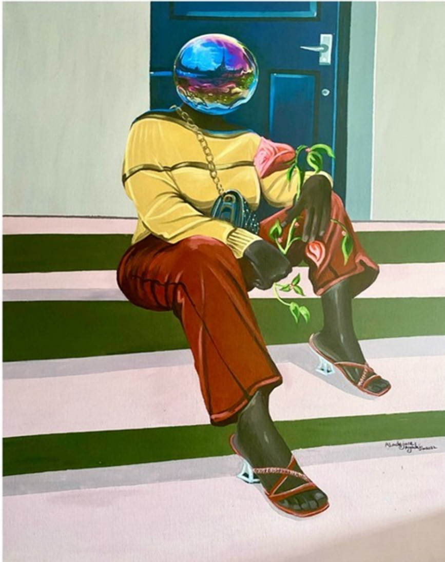
Title: Here Love Lives (2022) Acrylic on canvas 122 cm x 94 cm