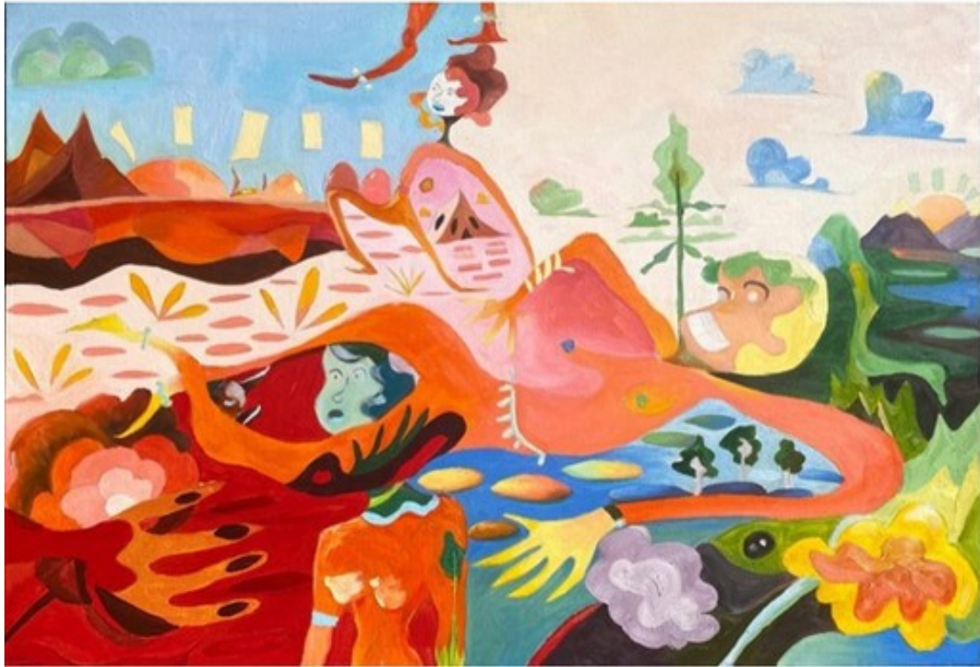
Title: Women Love To Have Fun (2023) Oil on canvas 36 cm x 24 cm