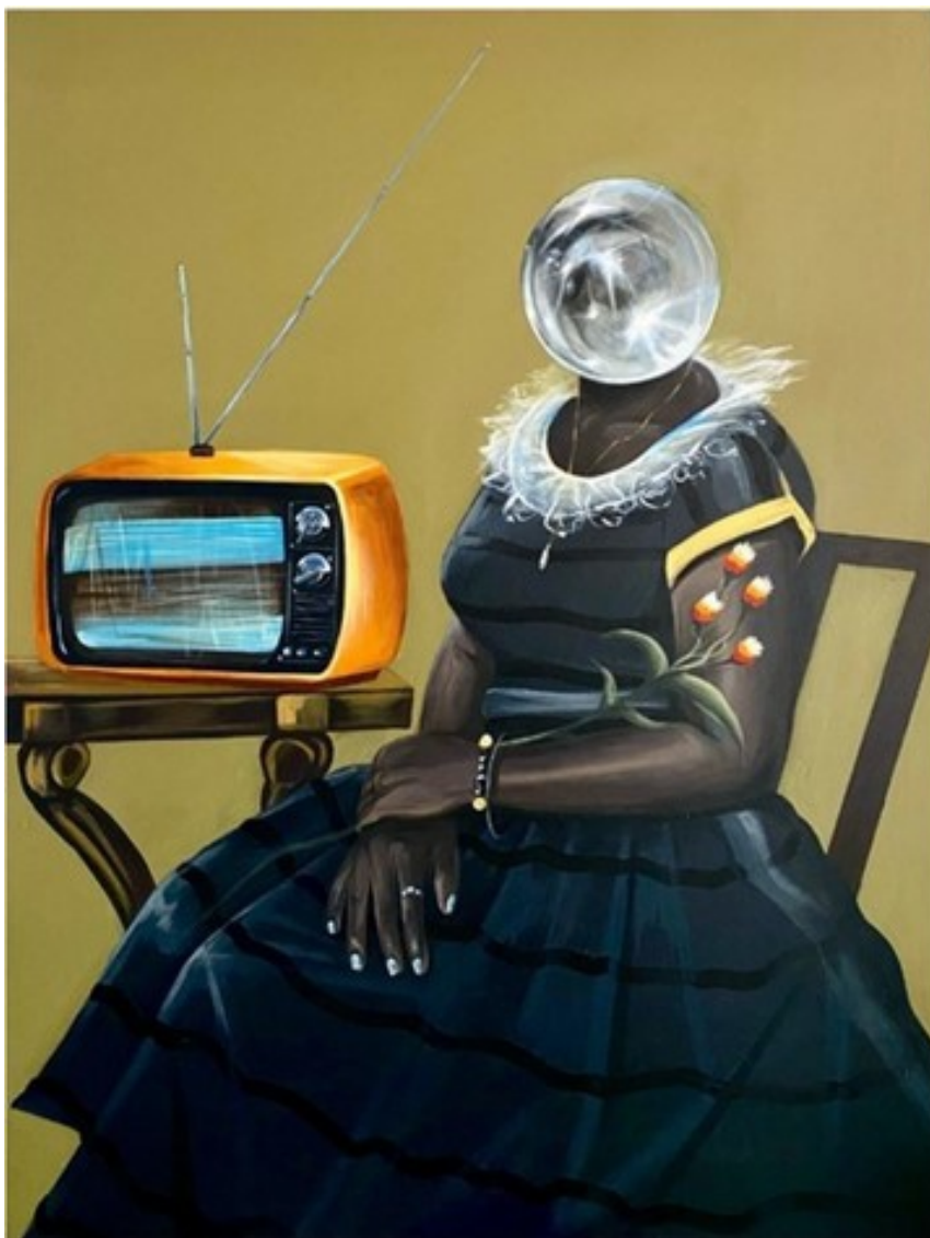
Title: Glamour (2022) Acrylic on canvas 122 cm x 94 cm