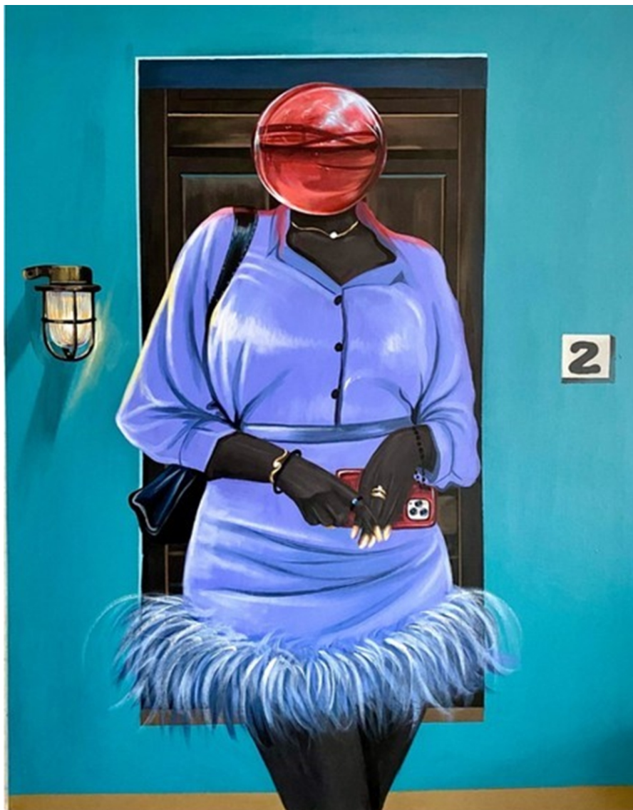
Title: Unresolved ii (2022) Acrylic on canvas 122 cm x 94 cm